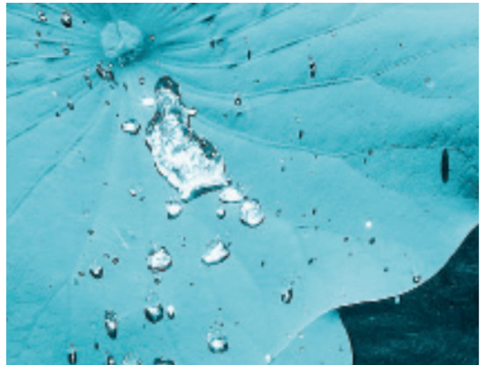
[Figure 1]: The lotus effect is a special case of water repelling, or hydrophobic, behavior

The hydrophilic self-cleaning coatings are based on photocatalysis: when exposed to light, they are able to break down impurities. Self-cleaning windows from this coating material are already commercially available. These kinds of windows act in two ways to clean its surface. The organic dirt absorbed on the window is broken down chemically by photocatalysis and water washes the dirt away by forming sheets due to the low contact angles. Titanium dioxide (TiO 2 ) is a well-known coating for hydrophilic