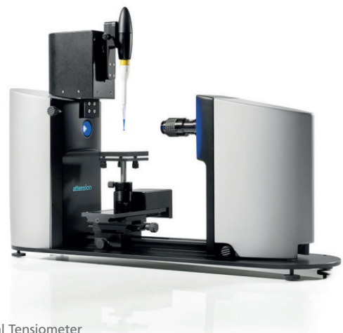
Theta Optical Tensiometer